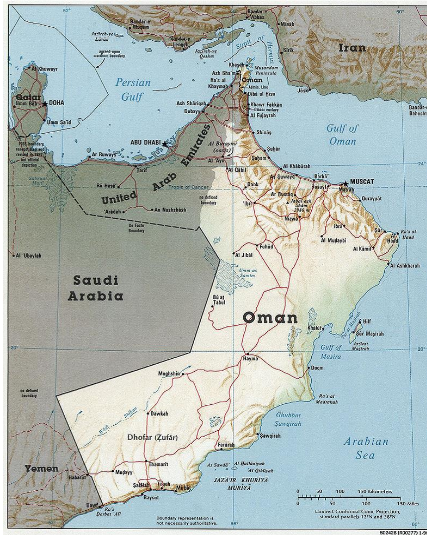
Figure 1: Map of the Sultanate of Oman (World Atlas, 2019)

As is clear from Figure 1, Oman has a long coastline that extends to 3,165km from the Strait of Hormuz in the north to the border of the Republic of Yemen, overlooking the Arabian Gulf, the Gulf of Oman, and the Arabian Sea (World Atlas, 2019).