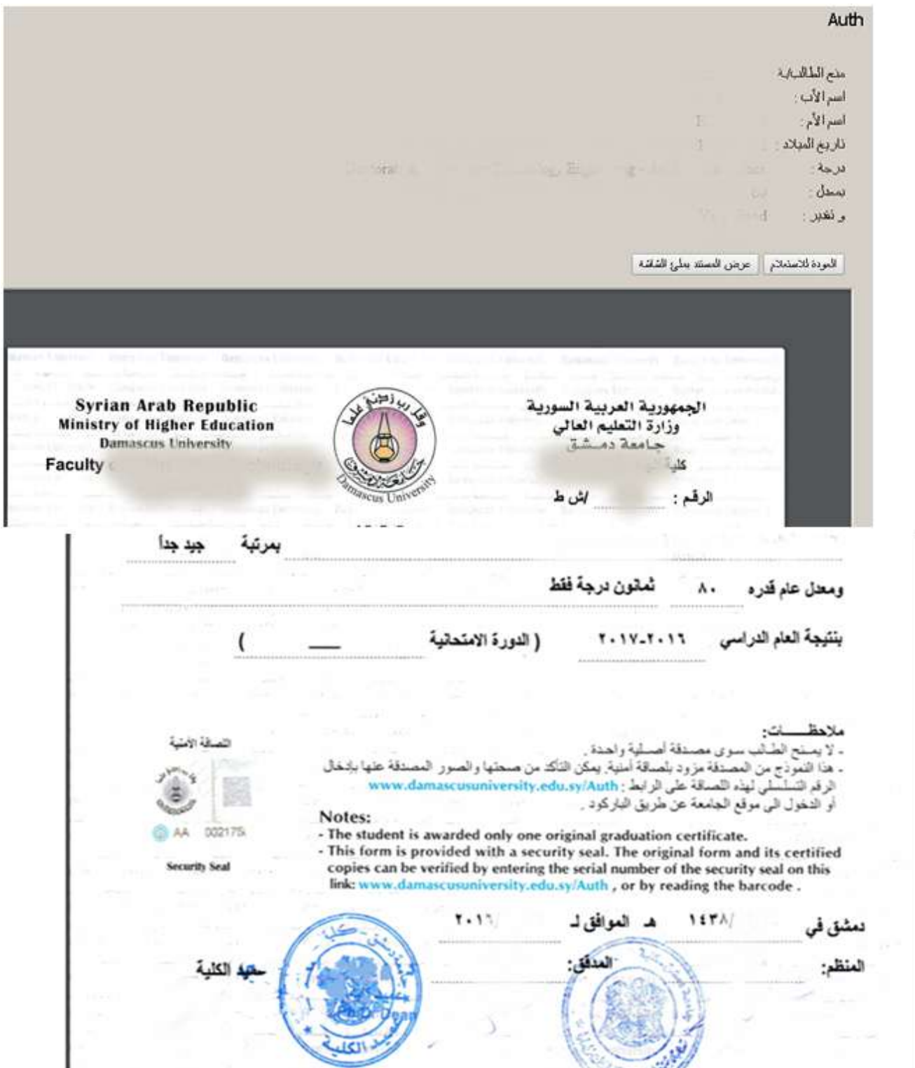
Fig.2 : Damascus University Authentication system

That this developed system is the first one in Syria to protect students certificates from cybercrime, that also universities around the world can use this system to check the validity of the students certificates who are applying to these universities.