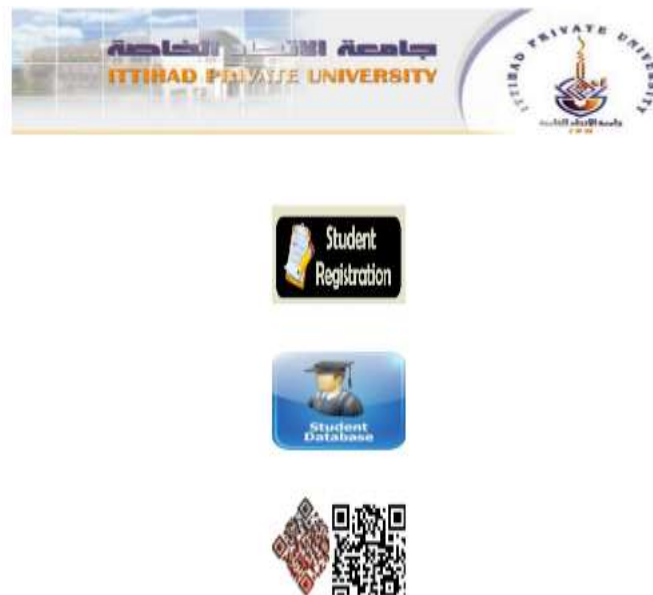
Fig.6 : admin page of the developed system

After the user login in the system he will be forwarded to the admin page which contains three main operations, student registrations, students database browsing, QR codes generating, the following figure shows the main operations of the admin page: