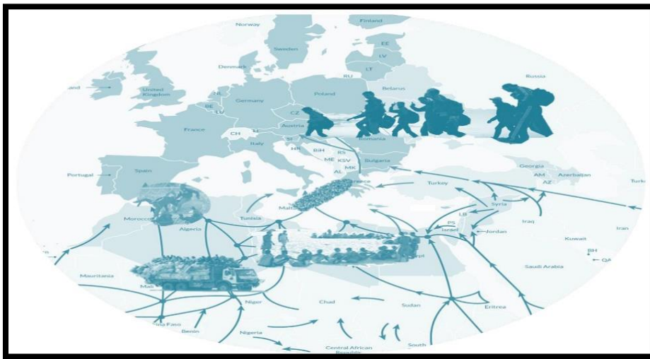
Figure (2) - Migration in The Mediterranean Region. Border Security Report. 2021. "Migration in the Greater Mediterranean Region." 2021 . https://www.border-security-report.com/wp-content/uploads/2021/08/Migration-in-the-Greater-Mediterranean-Region-1-768x693.jpg

Irregular sea crossings across the Mediterranean have become especially perilous. Migrants often board overcrowded and unseaworthy vessels, risking their lives on treacherous journeys. The Central Mediterranean Route, in particular, has witnessed many tragedies, with numerous shipwrecks, capsizing incidents, and deaths due to harsh weather conditions. Thousands have lost their lives while attempting to reach European shores.