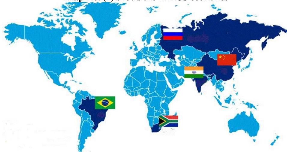
Map No. (1) shows the BRICS countries

The West believes that Russia hoped to use the BRICS group to increase its weight in the international system and that Russia's diplomacy in the BRICS group aimed at creating a "power multiplier" to increase the influence of Russia and the BRICS group on the international scene. Despite the sharp decline in Russian-Western relations after the conflict in Ukraine and Western sanctions on Russia, the BRICS group did not support or condemn Russia's actions in Ukraine, which creates a perception in the United States that it cannot strip Russia of its powerful