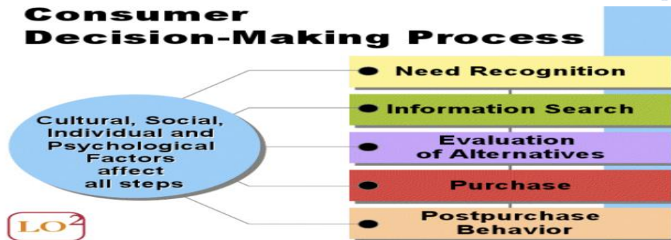
Figure 2 shows Consumer buying decision process

Source: Qazzafi, Sheikh., 2019, consumer buying decision process toward products, international journal of scientific research and engineering development— volume 2 issue 5, sep – October 2019 available at www.ijssred.com .