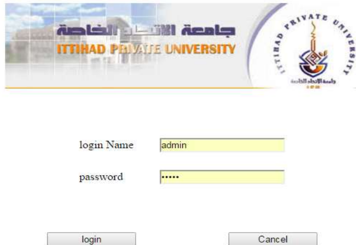
Fig.5 : login page of the developed system

After the user login in the system he will be forwarded to the admin page which contains three main operations, student registrations, students database browsing, QR codes generating, the following figure shows the main operations of the admin page: