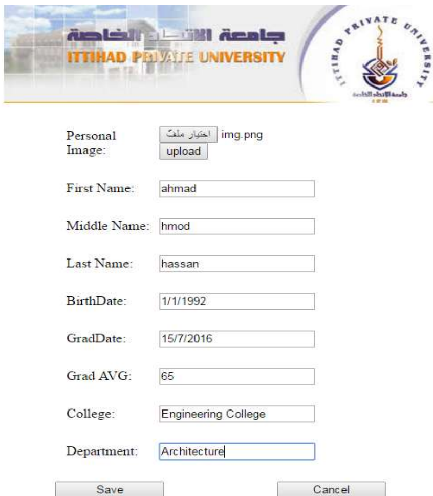
Fig.7 : registration page of the developed system

And in the student database browsing the operation shows all the registered students in the system, the following figure shows the database browsing :