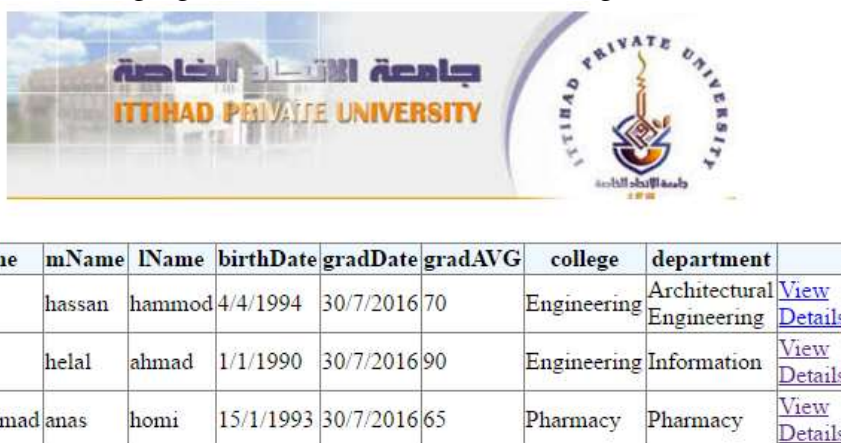
Fig.8 : database browsing page of the developed system

And in the student database browsing the operation shows all the registered students in the system, the following figure shows the database browsing :