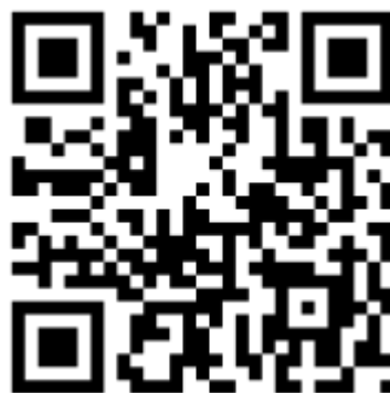
Fig.3 : QR Code

The QR code system became popular outside the automotive industry due to its fast readability and greater storage capacity compared to standard UPC barcodes. Applications include product tracking, item identification, time tracking, document management, and general marketing.[10], the following figure below shows the QR code :