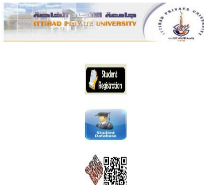
Fig.6 : admin page of the developed system

After the user login in the system he will be forwarded to the admin page which contains three main operations, student registrations, students database browsing, QR codes generating, the following figure shows the main operations of the admin page: