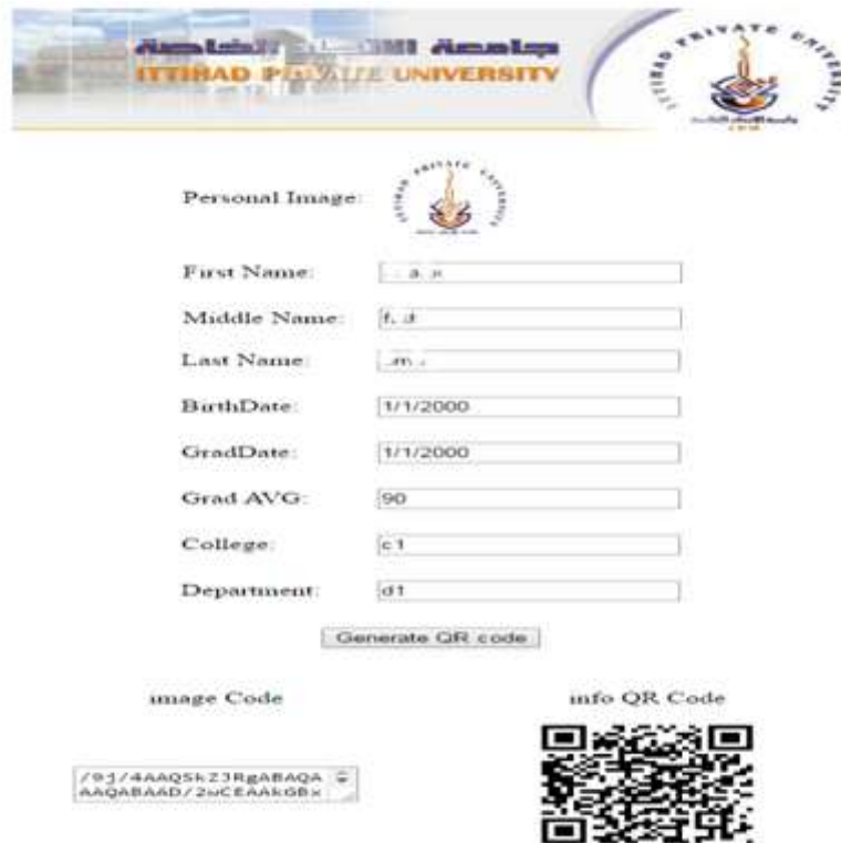
Fig.9 : QR code generating page of the developed system

can be sure about the information in the certificates, the following figure shows how the QR code is generated :