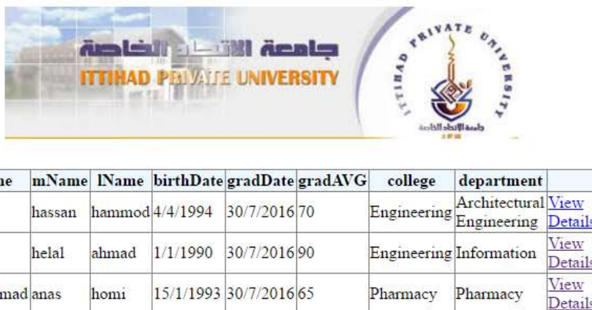
Fig.8 : database browsing page of the developed system

And in the student database browsing the operation shows all the registered students in the system, the following figure shows the database browsing :