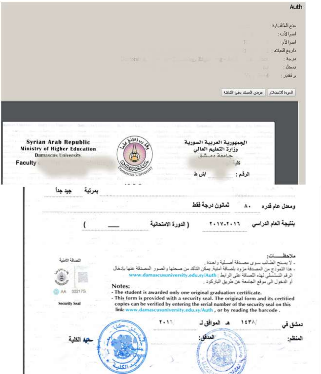
Fig.2 : Damascus University Authentication system

That this developed system is the first one in Syria to protect students certificates from cybercrime, that also universities around the world can use this system to check the validity of the students certificates who are applying to these universities.