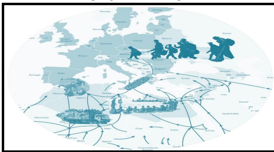
Figure (2) - Migration in The Mediterranean Region. Border Security Report. 2021. "Migration in the Greater Mediterranean Region." 2021 . https://www.border-security-report.com/wp-content/uploads/2021/08/Migration-in-the-Greater-Mediterranean-Region-1-768x693.jpg

Irregular sea crossings across the Mediterranean have become especially perilous. Migrants often board overcrowded and unseaworthy vessels, risking their lives on treacherous journeys. The Central Mediterranean Route, in particular, has witnessed many tragedies, with numerous shipwrecks, capsizing incidents, and deaths due to harsh weather conditions. Thousands have lost their lives while attempting to reach European shores.