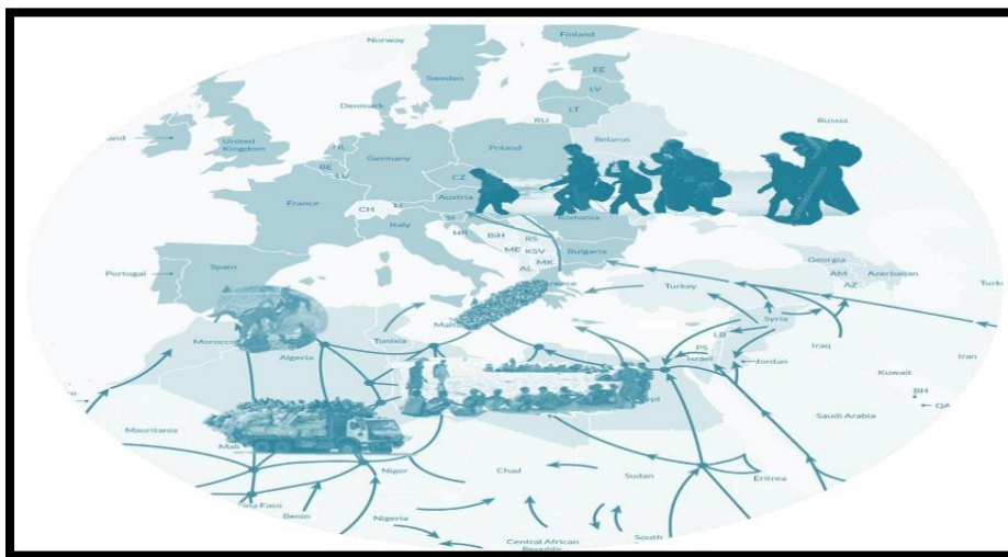
Figure (2) - Migration in The Mediterranean Region. Border Security Report. 2021. "Migration in the Greater Mediterranean Region." 2021 . https://www.border-security-report.com/wp-content/uploads/2021/08/Migration-in-the-Greater-Mediterranean-Region-1-768x693.jpg

Irregular sea crossings across the Mediterranean have become especially perilous. Migrants often board overcrowded and unseaworthy vessels, risking their lives on treacherous journeys. The Central Mediterranean Route, in particular, has witnessed many tragedies, with numerous shipwrecks, capsizing incidents, and deaths due to harsh weather conditions. Thousands have lost their lives while attempting to reach European shores.