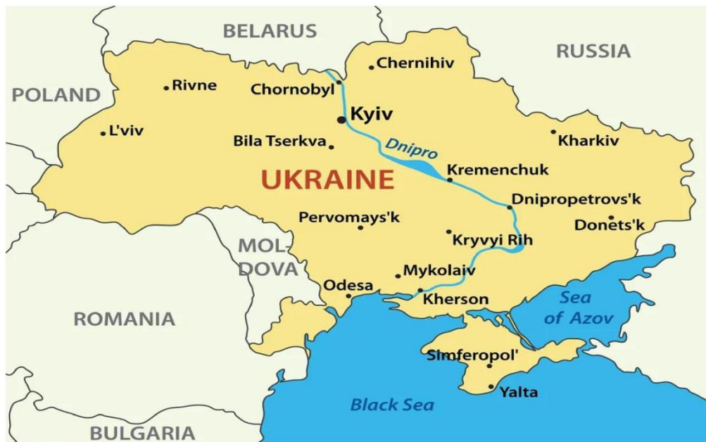
Figure 1: Shows the geographical location of Ukraine