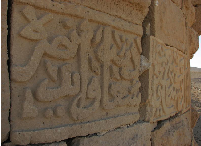
Pl. (6): Showing inscription no. 18 and the rest of inscription no. 17.