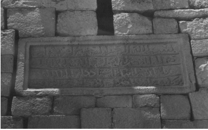
Pl. (14): Arabic inscription which dates the rebuilding of the castle back to the Mamluks (Sultan Aybak reign, inscription no.38).