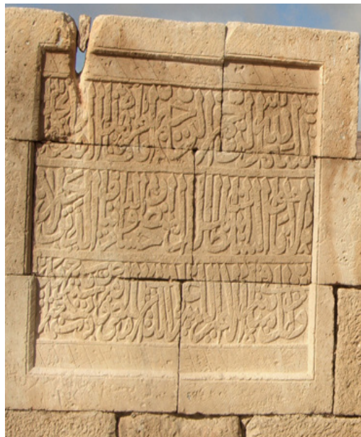
Pl.(9): Sultan Lajin inscription, no.28.