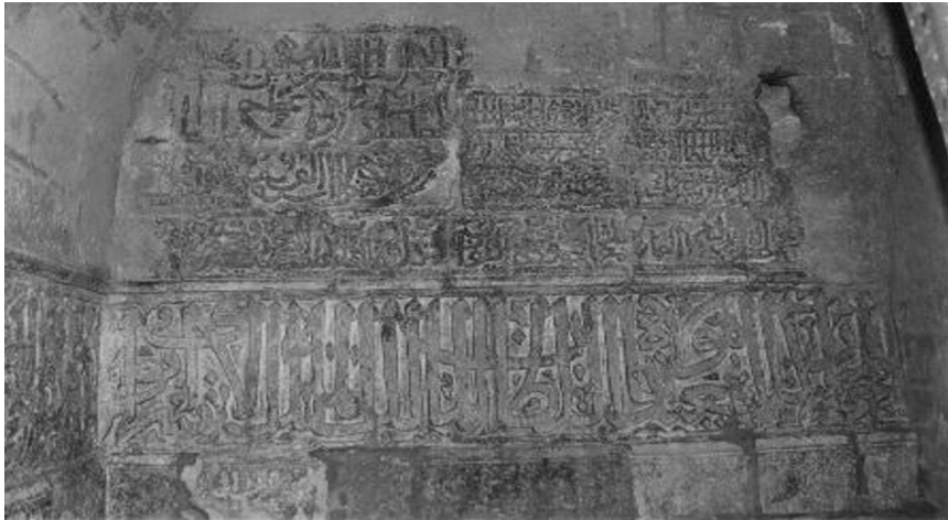
Pl. (12): Arabic inscriptions inside the outer liwan (1), relating Sultan Qanswah al-Ghuri's construction of the castle, inscription no. 31.