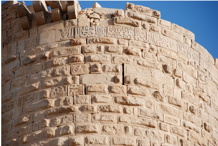
Pl. (4): inscriptions nos. 12, 13 and 14.