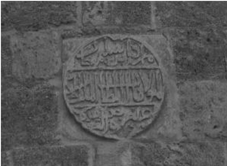
Pl. (11): Arabic inscription which refers to the rule of the Ottoman Sultan Murad the Third in 1587, inscription no. 30.