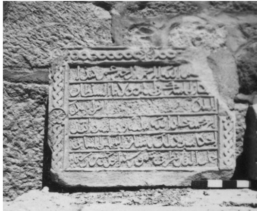
Pl. (8): Sultan Qutuz inscription, no. 26.