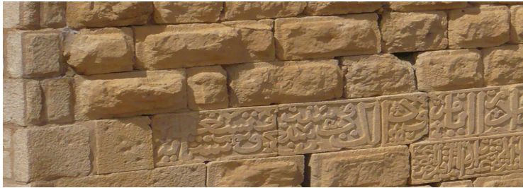
Pl. (3): Inscriptions, 9 and 10.