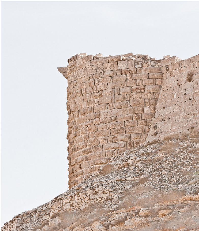
Pl. (5): inscriptions nos. 15, 16, and 17.