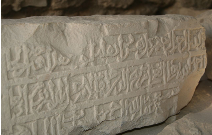
Pl. (10): Inscription no. 29.