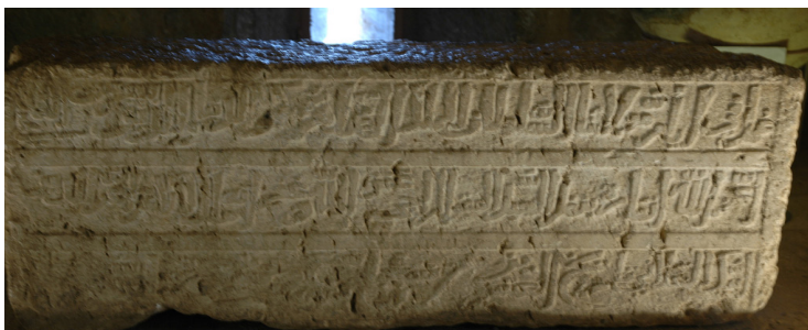
Pl. (2): Sultan Baybars inscription no.3, Ajloun Castle.