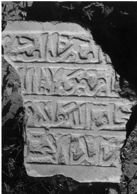
Pl. (7): Inscription no. 25.