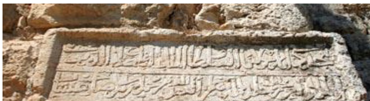
Pl. (1): Saladin inscription no.1, Ajloun Castle.